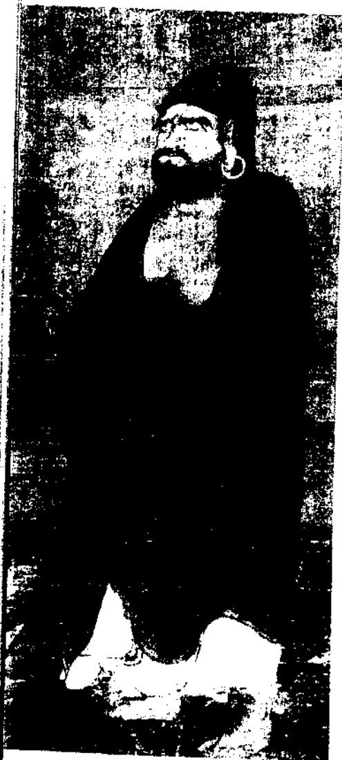
Figure 1. Bodhidharma on a Reed (detail), 14th c. Hanging scroll; color on silk; 102.4 × 38.5 cm. Anon.; inscription by Kozan Ikkyō 固山一峯 (1295–1360). Gyokuzō-in Temple, Kyoto.