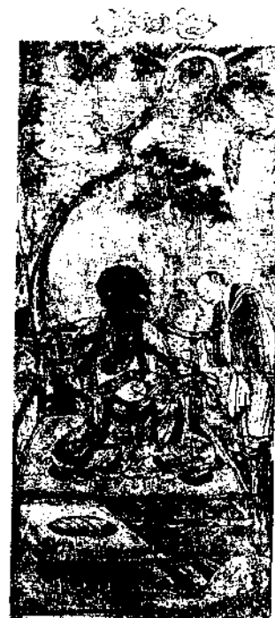
Figure 5. A Long Roll of Buddhist Images (detail), 1173–1176. Handscroll; ink, colors and gold on paper; 30 × 1881.4 cm. Attr. to Chang Sheng-wen 張勝溫. National Palace Museum, Taipei.