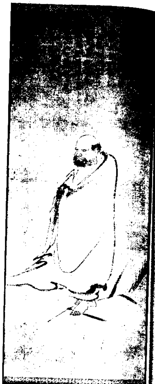
Figure 2. Bodhidharma on a Reed (detail), 14th c. Hanging scroll; ink on paper; 89.2 × 31.1 cm. Anon.; inscription by Liao-an Ch'ing-yü 了庵清欲 (1288–1363). Cleveland Museum of Art, John L. Severance Fund, 64.44.