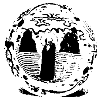
Figure 4. Bodhidharma on a Reed , late-16th c. Dish painted in underglaze blue and colored enamels. Topkapi Saray Museum.