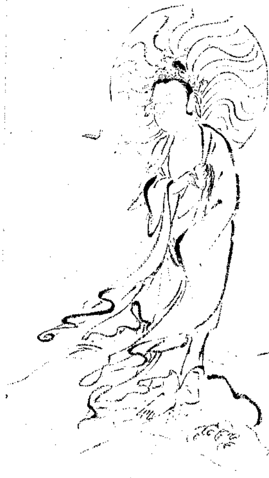
Figure 13. Kuan-yin with a Willow Branch , 13th c. Anon. Hanging scroll; ink on paper, 91.1 × 43.7 cm. Private collection.