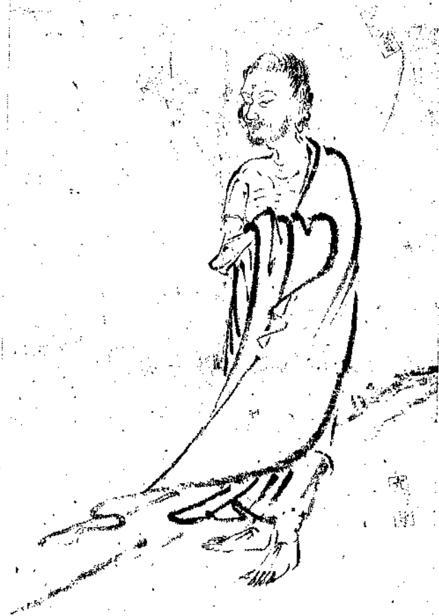
Figure 11. Shussan Shaka , 13th c. Anon. Hanging scroll; ink on paper, 90.8 × 41.9 cm. Seattle Art Museum, Eugene Fuller Collection (50.124).