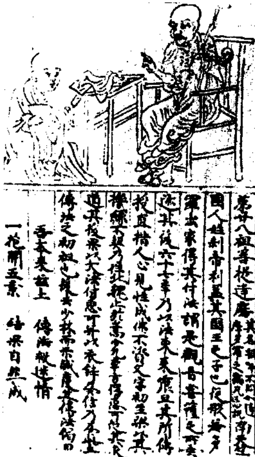
Figure 7. Established Patriarchs Transmitting the Dharma and Correct Teaching (detail), copied 1154. Handscroll, ink on paper; 30.5 × 1286.7 cm.

sung 契嵩 (1011–1072). 21 The oldest known copy of the illustrated portions is preserved in the Kanchi'in 觀智院 of Tōji Monastery 東寺 in Kyoto, and, according to the colophon, was copied in the fourth year of Nimp'yō 仁平 (1154) by the monk Jōen 定圓. Strong evidence suggests that it may have been modeled on a rubbing taken from a stele erected in 1064 in Su-chou at the Longevity Hall, or Wan-shou Ch'an-yūan 萬壽禪院 (where the first edition of Ch'i-sung's text was printed that same year). 22