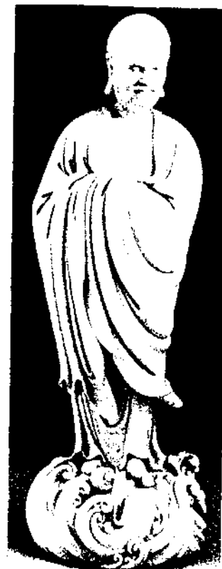
Figure 3. Bodhidharma , ca. 1650–1700. Blanc-de-chine porcelain. Peking Palace Museum.