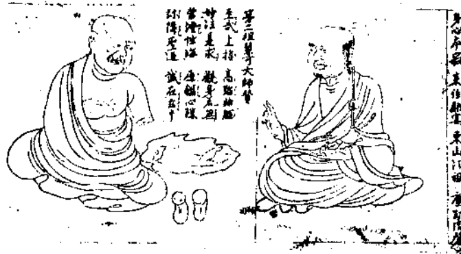
Figure 6. Portraits of Patriarchs and Teachers from Three Countries (detail), dated 1150. Handscroll, ink and light color on paper. Daigoji, Kyoto.