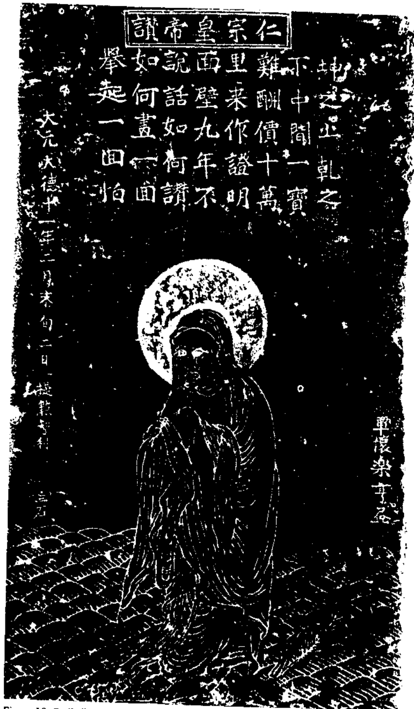
Figure 10. Bodhidharma on a Reed Rubbing from a stele engraving of 1308. Shao-lin Monastery, China.