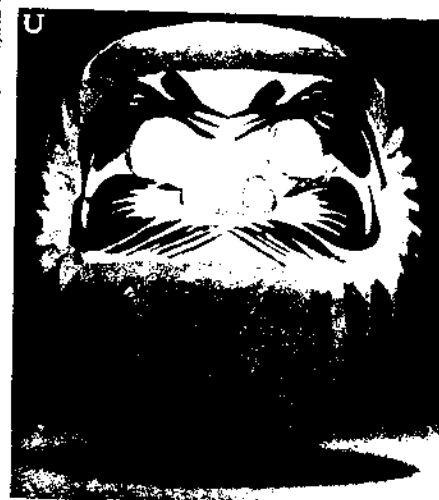
Figure 14. Daruma Doll , 20th c. Painted wood; 15 cm. Shibumi Trading Company Brochure.