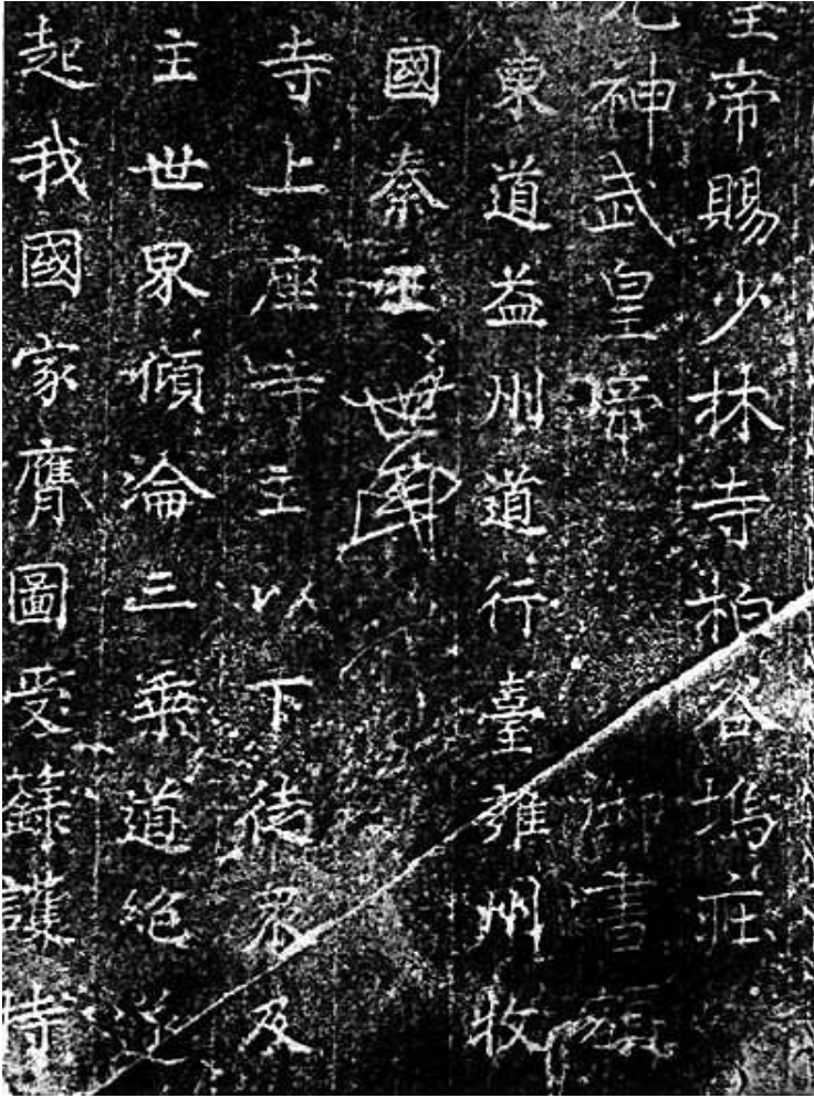
Figure 1. Li Shimin's Autograph, "Shimin"

As copied onto "Shaolin Monastery Stele"; photograph by the author.